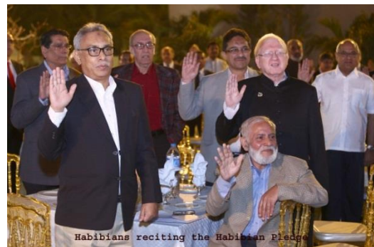
Habibians reciting the Habibian Pledge