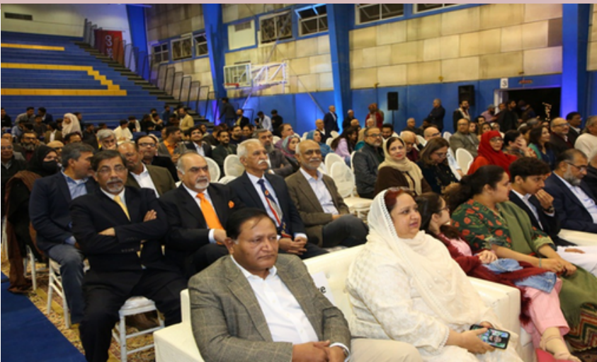
Esteemed Habibians reliving their good old carefree days!