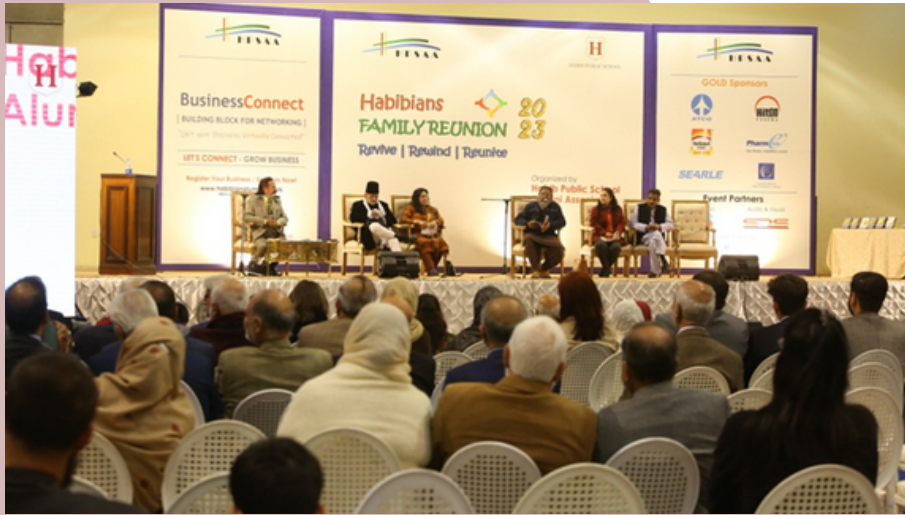
Esteem Habibians enjoying the Mazahiya Mushaira