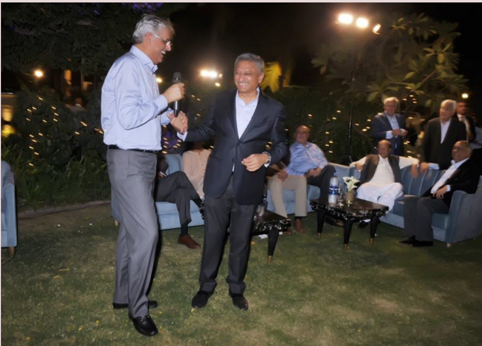
The two ministers lighten the atmosphere