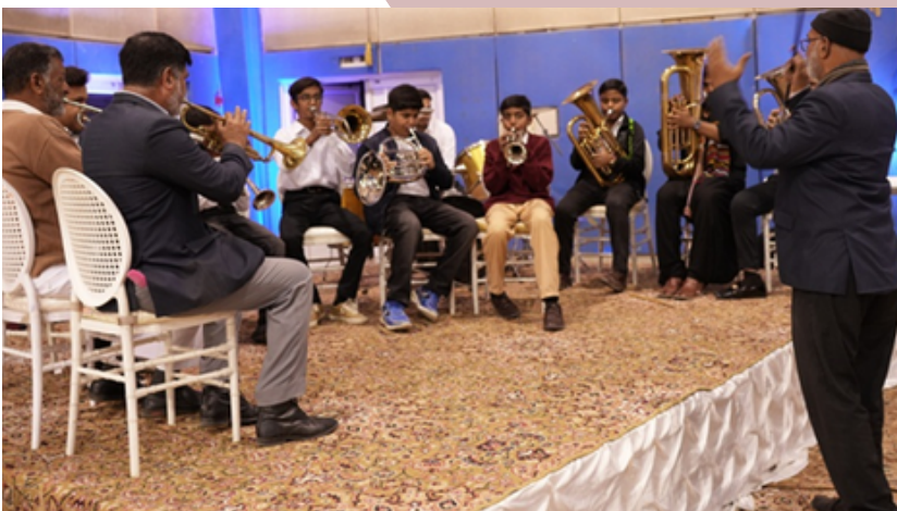
Habib Public School's Band Performance